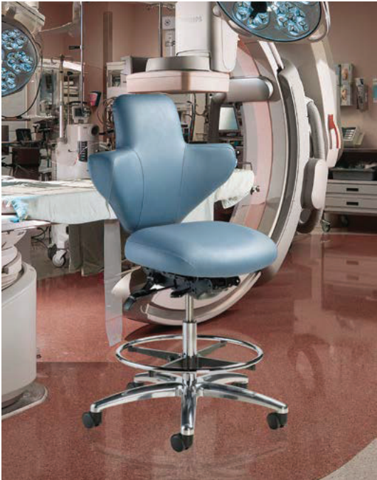
Surgeon Console 1864-DS

PATENTED: Internal lumbar and lateral back support that adjusts to the users back for personalized support and comfort.