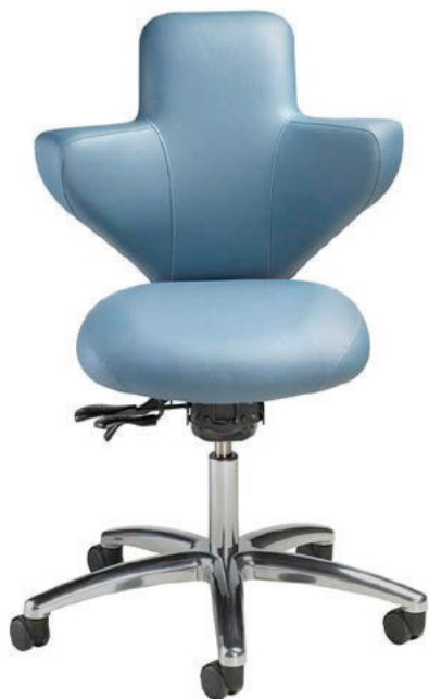
Surgeon Console 1864